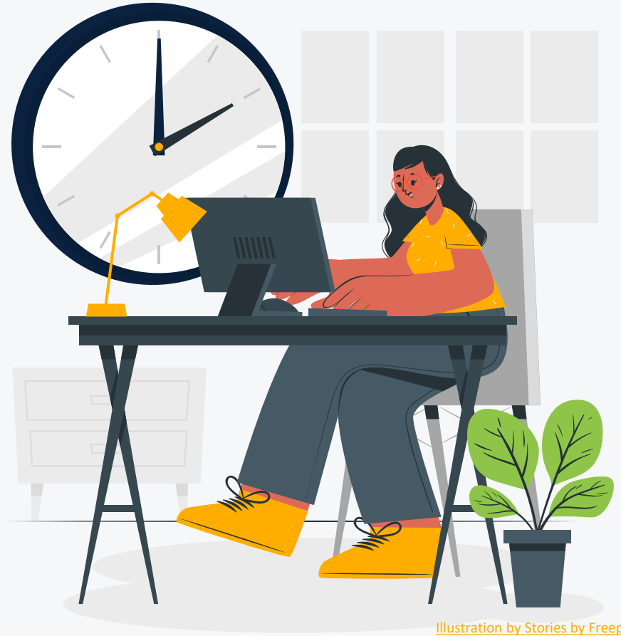
Illustration by Stories by Freepik