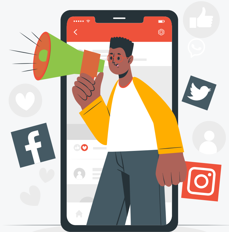
Illustration by Stories by Freepik

Check out more graphics for social media!