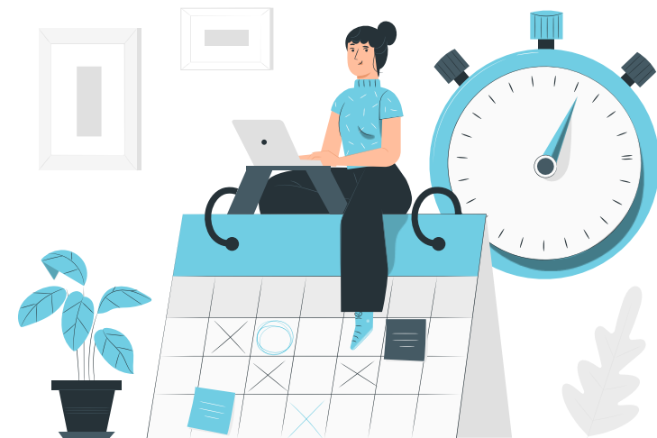
Illustration by Stories by Freepik