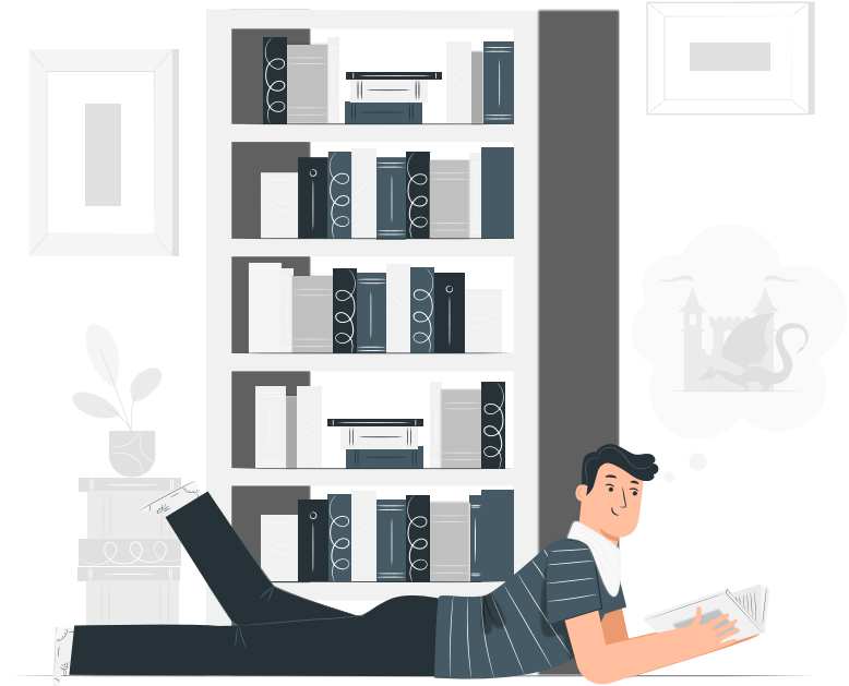
Illustration by Stories by Freepik