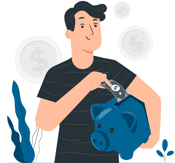
Illustration by Stories by Freepik