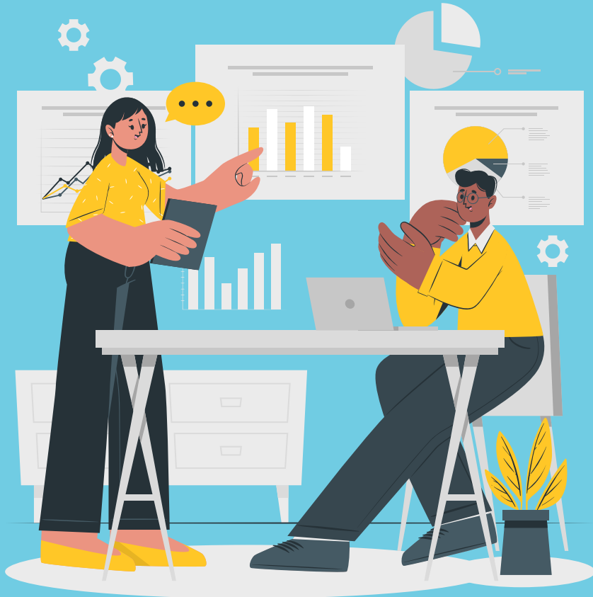
Illustration by Stories by Freepik

I'm looking for specific information about titles in my collection.